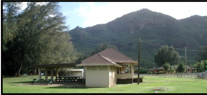
Niupalu Pavilion is reserved all of 2008 for monthly workshops.

THE INTENTION OF THESE WORKSHOPS: TO STRENGTHEN OUR UNITY and BETTER PROVIDE FOR THOSE STILL SUFFERING FROM ALCOHOLISM.