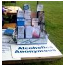
East Side Family Summit

The meeting began with a quick report on our participation at the East Side Family summit where Al-anon graciously allowed us to share their space. Several pamphlets and schedules were distributed at that event and we found being with Al-anon to be a very positive experience.