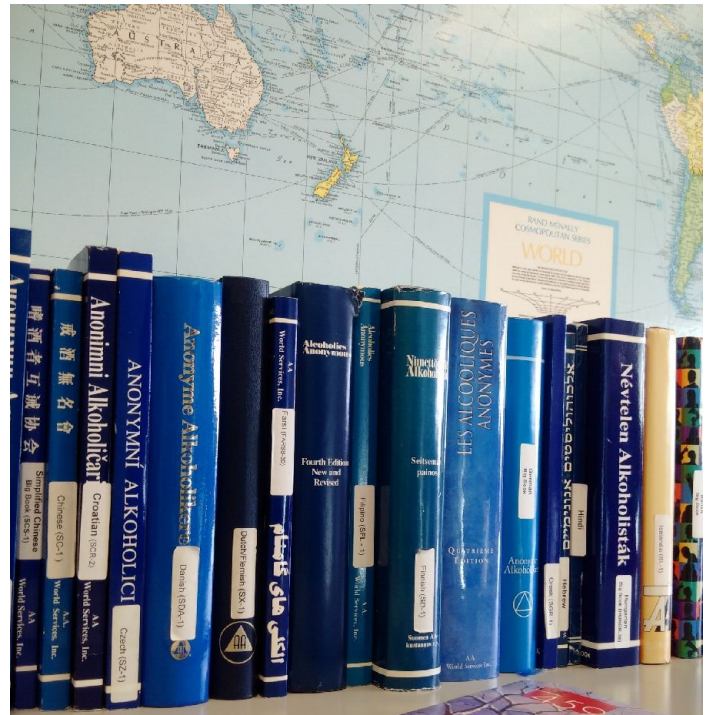
Foreign Language Big Books

The meeting closed with the serenity prayer in 28 languages!!!